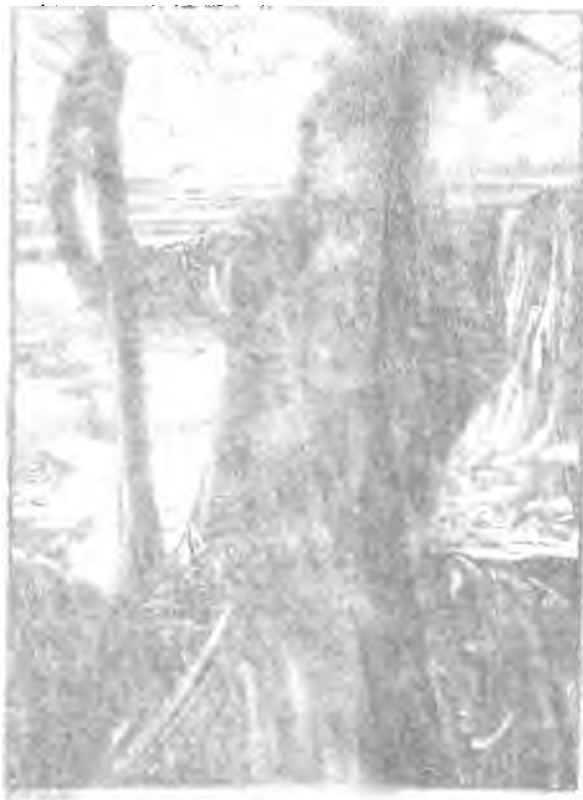
Person standing in a field